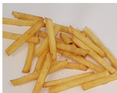
Frying test result, 9 months of storage at 7°C, France