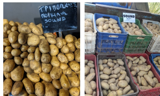
Small grocery store in Tripoli, Peloponese, Greece

In Greece, Sound has found its place in supermarkets, local grocery stores as well as local farmers markets. "They all like the shape and the skin quality of Sound, which is very important, especially for small grocery stores and farmers market where the potatoes are presented in small stacks on stalls", says our partner Panos from GPK Agrohellas in Greece. "Clients tell us that Sound has a good taste with good home frying quality, but they also liked them baked and boiled."